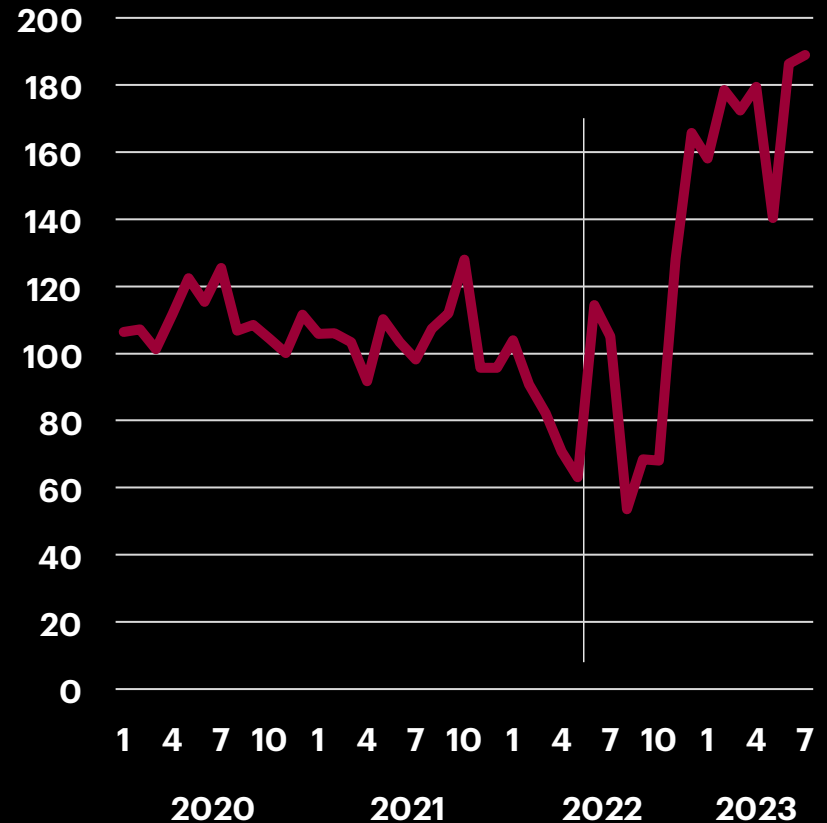
Average South-Korea selling price of imported E-Stone slabs in US (usd/sqm)

This surge in average selling prices can be attributed to the successful launch of Hyundai's new Kreos slabs in the market during the first half of 2022, proving the crucial importance of differentiate products from standards through new technologies.